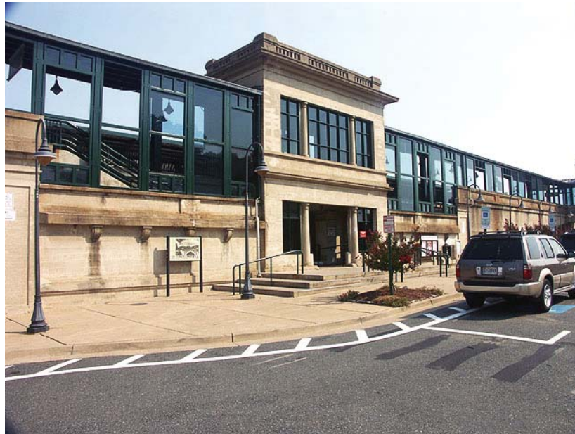
Plans are underway to rehabilitate the bridges surrounding the Fredericksburg Station.