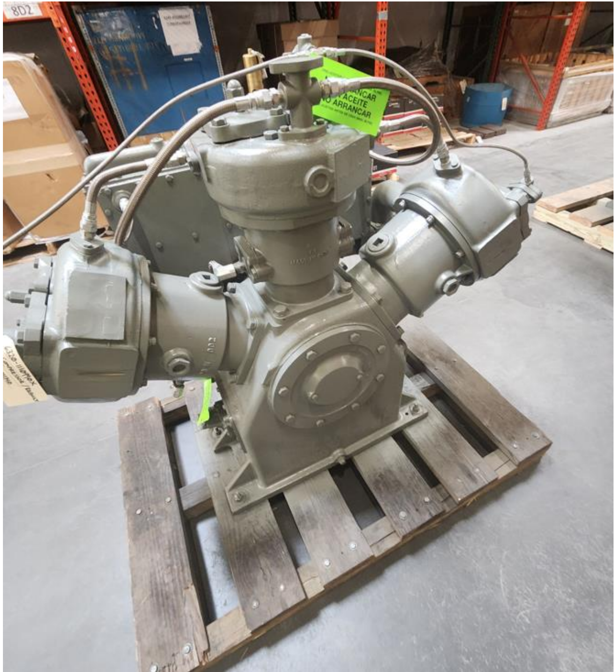
A. Rear View