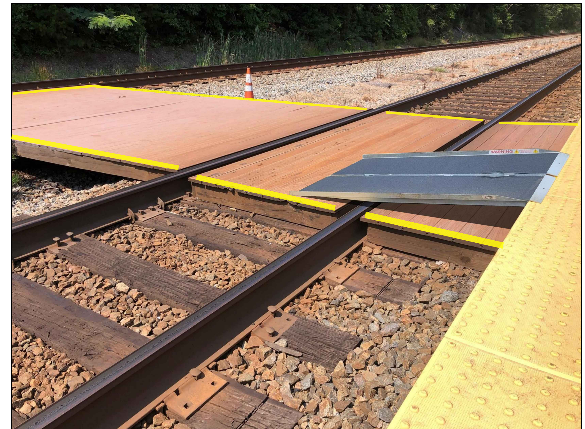
PHOTO #2: TIMBER CROSSING WITH REMOVABLE RAMP DEPLOYED FOR ASSISTED WHEELCHAIR ACCESS