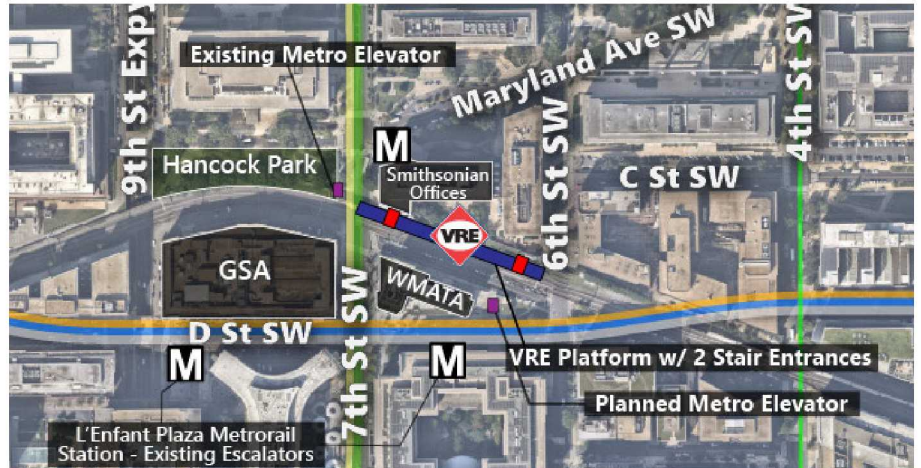
The existing VRE L'Enfant Station is located between 6 th and 7 th Streets SW, above street level. The current 555-foot platform, which can only serve one train at a time, is accessed via stairs at 6 th and 7 th Streets SW and an ADA ramp at Hancock Park.