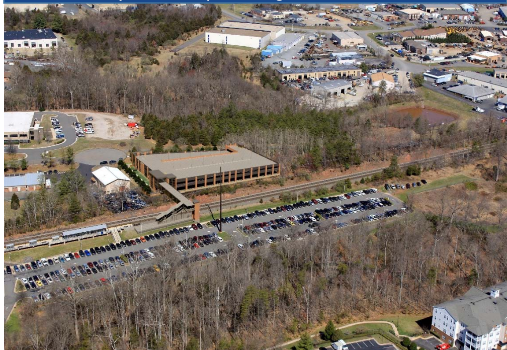
Illustrative Birdseye View of Proposed Garage