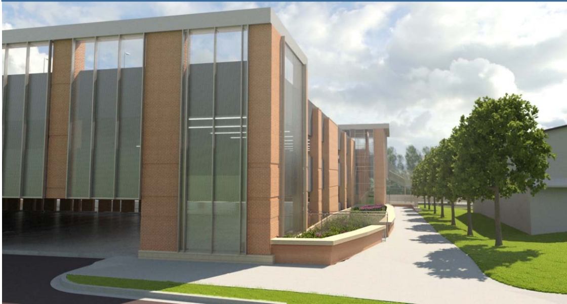
Illustrative View of Parking Garage From Park Center Court

Preliminary design and environmental analysis is currently underway. Final design is anticipated to begin in Fall 2017. Funding is being sought for construction.