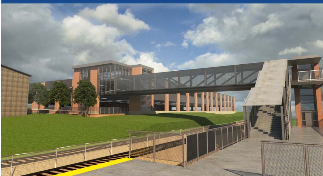
Illustrative View of Parking Garage From VRE Platform

Do you have any other questions or comments?